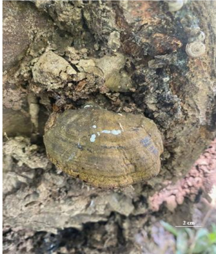
Plate (7): Phellinus Igniarius in natural habitat