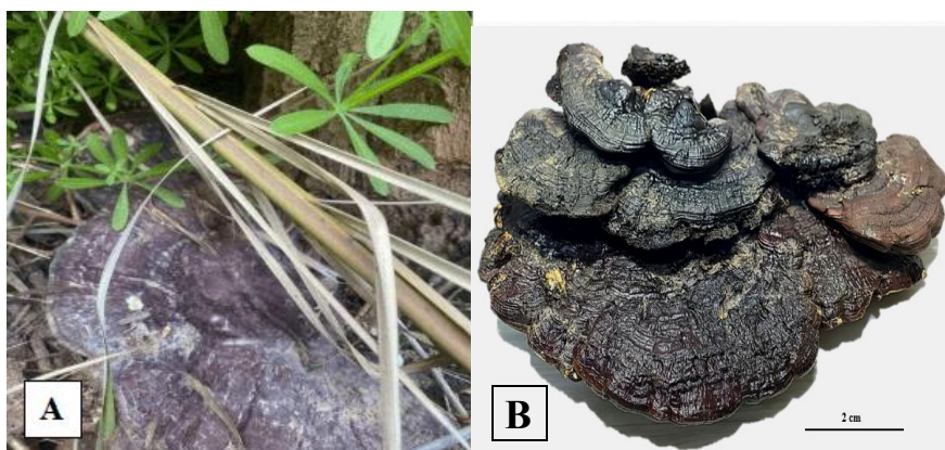
Plate(8): Ganoderma lucidium ; (A) In natural habitat, (B) In laboratory

Microscopic characteristics: brown, double-walled, ellipsoid to almond-shaped basidiospores measuring approximately (W: 9–12 × L: 6–8 μm), with the inner wall bearing fine echinulate ornamentations. Clavate basidia measure (W:20–30 × L:6–10 μm), and typically with four-spored. The species exhibits a trimitic hyphal system, comprising generative hyphae (thin-walled, with clamp connections), skeletal hyphae (thick-walled and unbranched), and binding hyphae (highly branched and thick-walled), contributing to the fruiting body's tough and durable texture. Cystidia rare or absent.