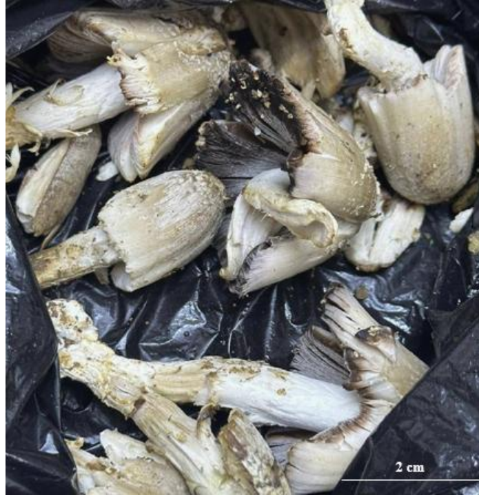
Plate (6): Coprinellus micaceus in natural habitat.