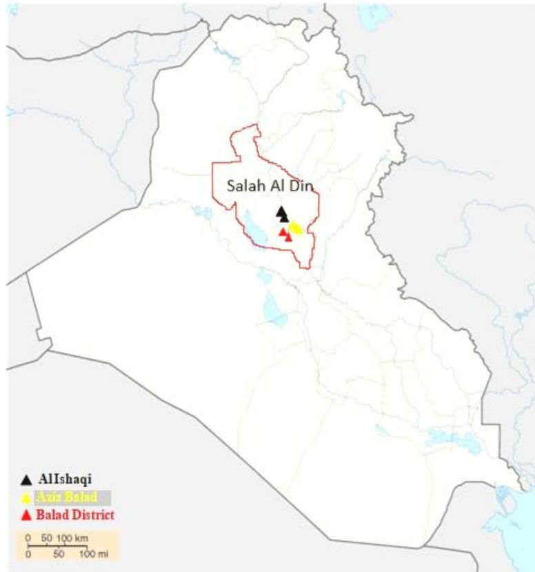
Map (1): The Sampling locations (Balad District, Al Ishaqi and Aziz Balad).