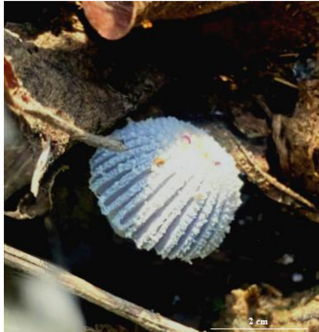
Plate (3): Coprinellus disseminatus in natural habitat.