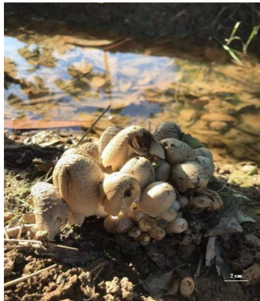
Plate (5): Coprinopsis atramentaria in natural habitat.

Microscopic characteristics: smooth, elliptical, and dark brown spores, measuring around w:10-14 \times L: 6-8 \mu m . Club-shaped basidia and four-spored. Cheilocystidia (located on the gill edges) present and variable in shape. Clamp connections present in the hyphae.