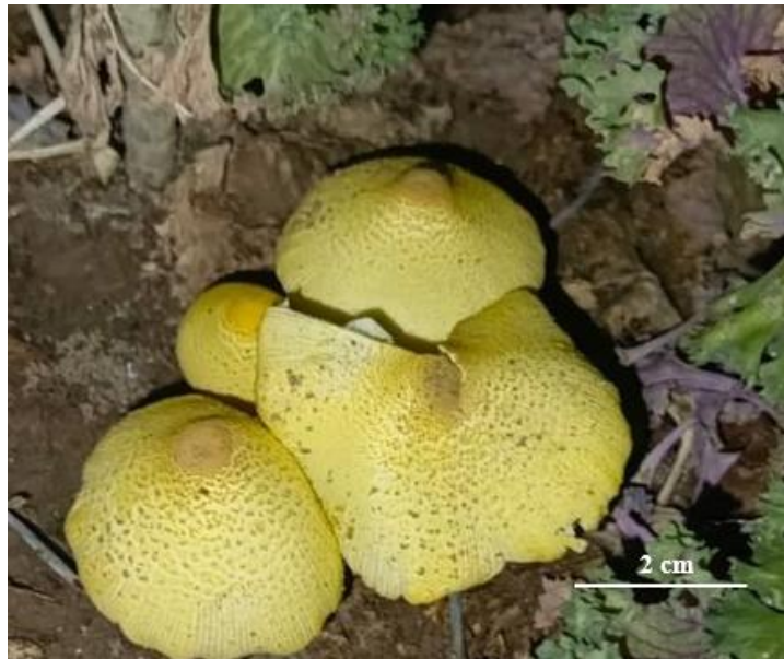
Plate (1): Leucocoprinus birnbaumii in natural habitat.

Macroscopic characteristics: L. birnbaumii is bright yellow and has a delicate structure. Cap bell-shaped when young and flattens with age, measuring 2–5 cm in diameter, with a powdery surface. Gills are free, crowded, and pale yellow; stem slender, hollow, and yellow, a small ring near the top. Produce a white spore print (Pl. 1). Microscopic Characteristics: spores are smooth, elliptical to almond-shaped with a visible germ pore and a dextrinoid reaction in Melzer's reagent (W: 4-7 \mu\text{m} L: 6-11 \mu\text{m} ). Basidia club-shaped and four-spored. Cheilocystidia bottle-shaped. Clamp connections present in the hyphae.