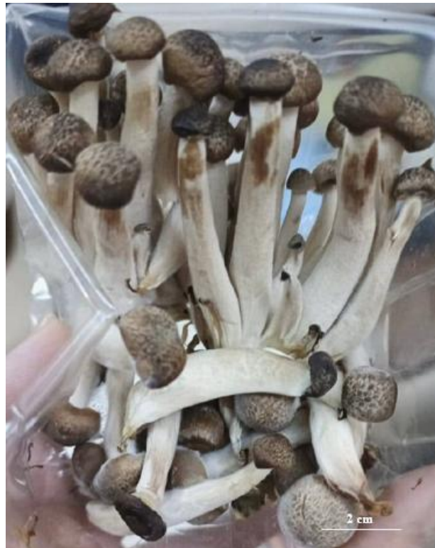
Plate (4): Hypsizygus tessellatus collected from nature in sterile plastic.

Microscopic characteristics: smooth, ellipsoid spores, measuring W:6-8 \times L: 4-5 \mu m in size, colorless and non-amyloid. Clavate (club-shaped) basidia, 4-spored, and measuring approximately 25 \mu m in length. Hyphal System: monomitic hyphal system consisted of septate hyphae with clamp connections often present. Thin-walled smooth surface colorless hypha. Cystidia: absent or very rare in Hypsizygus tessellatus . Spore print: white in colour..