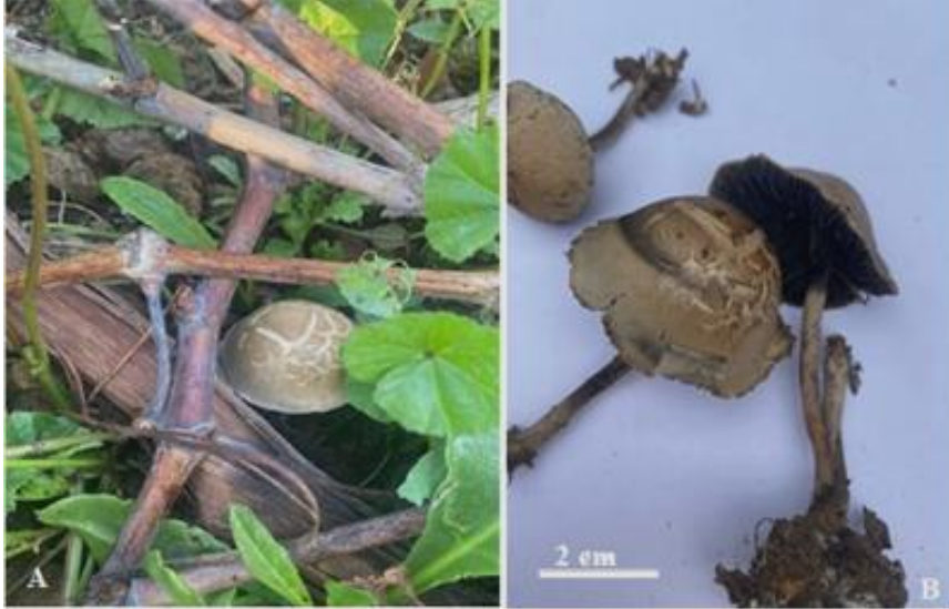
Plate (2): Panaeolina castaneifolia ; (A) In natural habitat, (B) In laboratory.